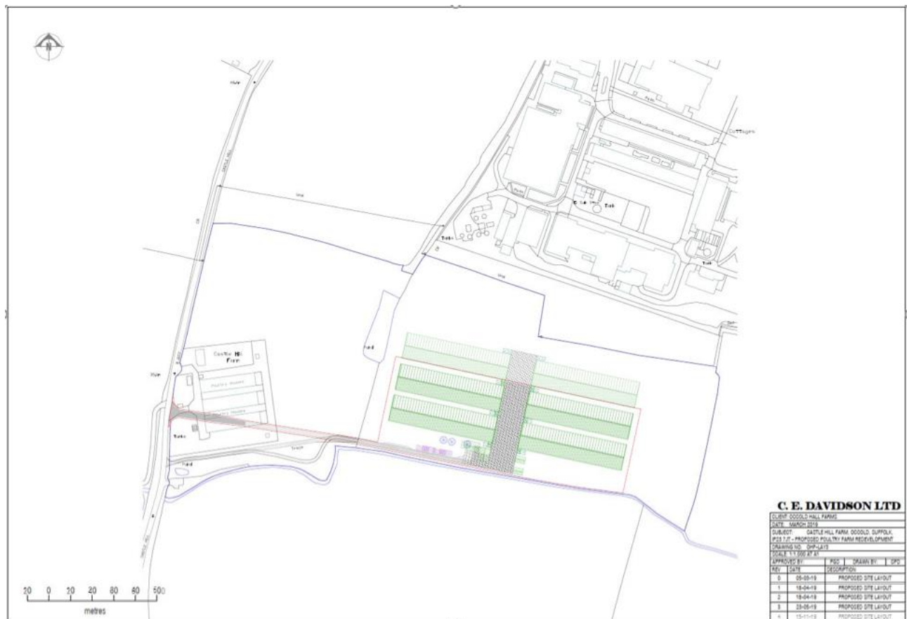
Figure 2 – EIA Scoping Layout superimposed on the final planning layout which has involved reducing shed numbers from 6no. to 4no., moving ancillary equipment out of the flood zone and amended the access track

4.10 Scale; Each of the 3no. poultry houses is 22.9m x 97.5m with a height to the eaves of 2.4m and 5.1m to the ridgeline of the pitched roof. Each shed includes 16no. ridge mounted exhaust fan chimneys, which give an overall height of 5.7m from ground level.