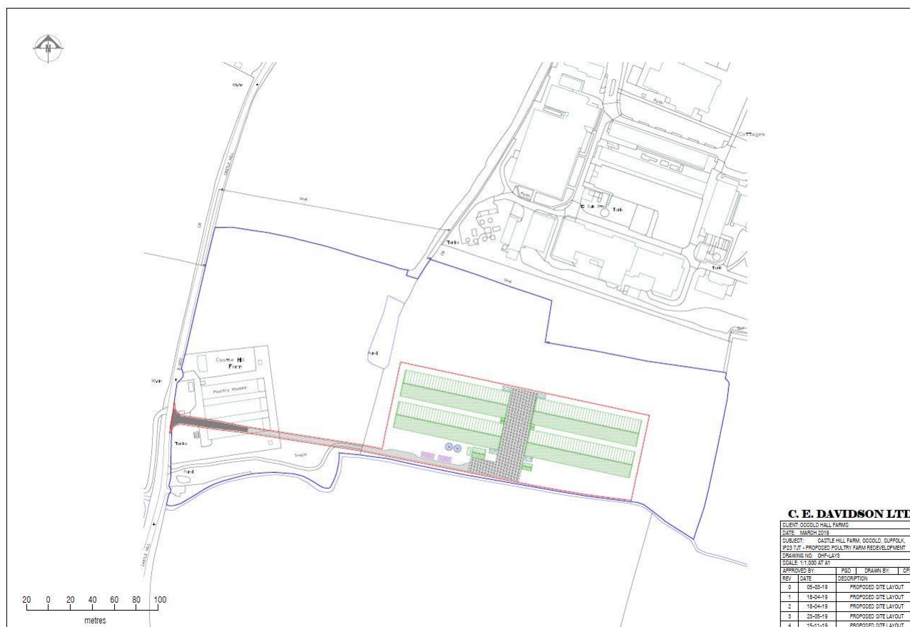
Figure 1 – Proposed Site Layout