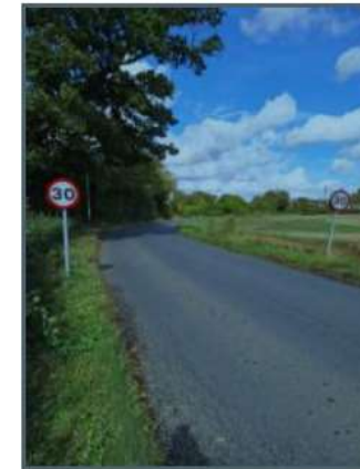
Wilby Road – may not be enough room for larger sign.